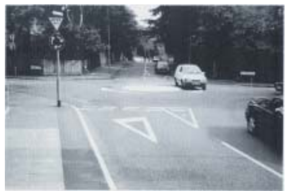
Photo illustration of typical mini roundabout

All regular-sized vehicles such as cars, jeeps & trucks must pass to the left of the painted circle.